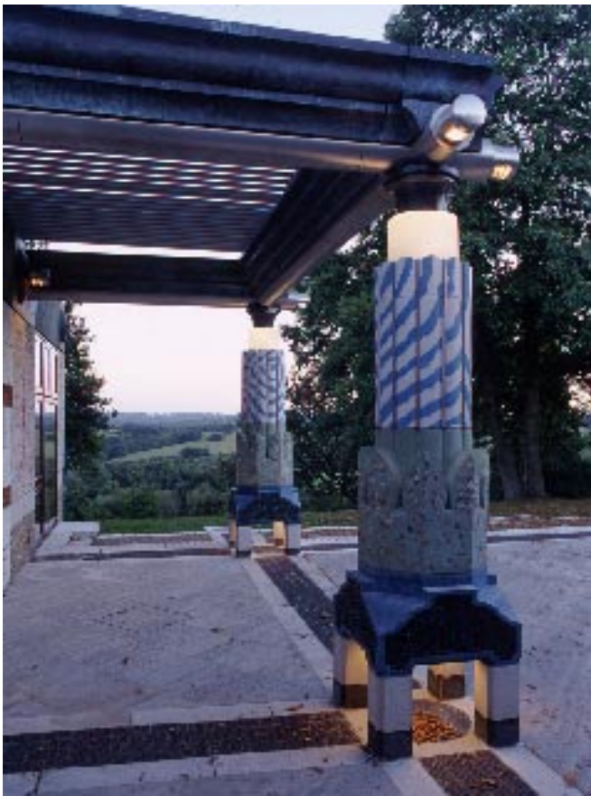
The 'fiery core' of the 'columna lucis' illuminates the cubic 'theatre of appearances' which the Architectural event hollows out of the Mountain.