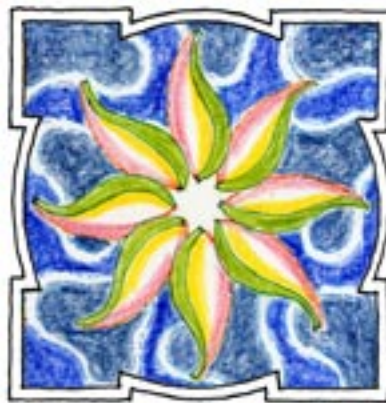
Stage 2: Earth: The element of embodiment. The 'dark sun' births' from the oceanic deeps as a radiating, growing, floating, efflorescence.