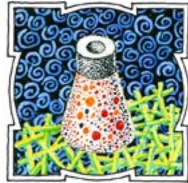
A 'nest of reeds' floats upon the deep. It carries the the cone of Hestia inside whose hearth-ashes the 'hot spark' is hidden and protected.