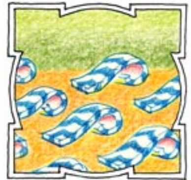
The infinite Ocean of Contingency on which sails the Raft of the Founders. It hides the submarine Mountain, of 'That which was always There' from the searching Eye of the Germ'.