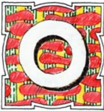
Stage 5: Idea: the 'Fifth Element' that is 'beyond' the four palpabilities. 'Thought', the doubly-curved shine on the black capital is the true illumination of reality.