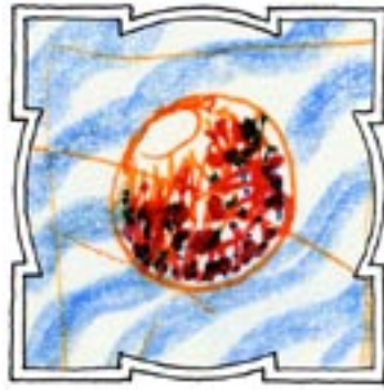
The original form of 'that which comes from afar'. It is the 'bright spark', the germ of the idea that begins any project.