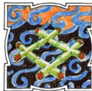
The Raft of the Promoters is woven from a 'canonic' logos whose form is the hypostylar reticule of Infinity. It both carries, guides, and targets the Fiery Germ onto its final destination: the Mountain of the Place.