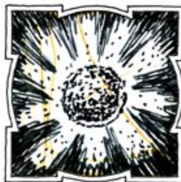
Stage 1: The Dark Sun is the 'cold spark' of 'that which was always there'. When it is reached by the sharp fire of the 'columna lucis' it is stirred into its cycle of powerful vitality.