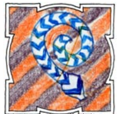
The Serpentine coil of Time, sign of an infinite resistance that guards the Mountain. Its grip must be loosed by the invading agency.

-as 'told' in the iconic language of a Modernised Architecture.