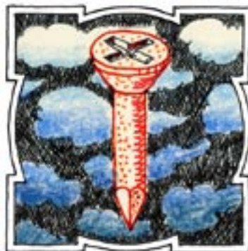
The Columna Lucis, wielded by the Initiator, is plunged like a Sword of Light into the 'submarine mountain' of the genius loci. It pins the Raft to it, shattering it into pieces.