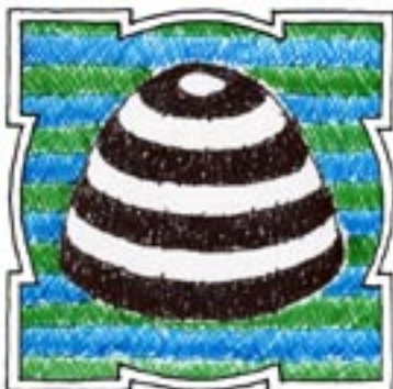
The Mountain of 'That which was always there'. Nights and days layer into the confused and tangled pile of obduracy that is a 'Place'.