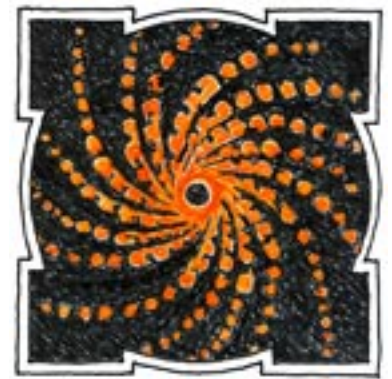
Stage 4: Light: the Element of Sight that forms images. The point of darkness at the centre of the fiery wheel of visual impressions is the dark genesis of 'ideas'.

THE ONTOGENETIC AND THE PHYLOGENETIC STORIES OF THE SIXTH ORDER.